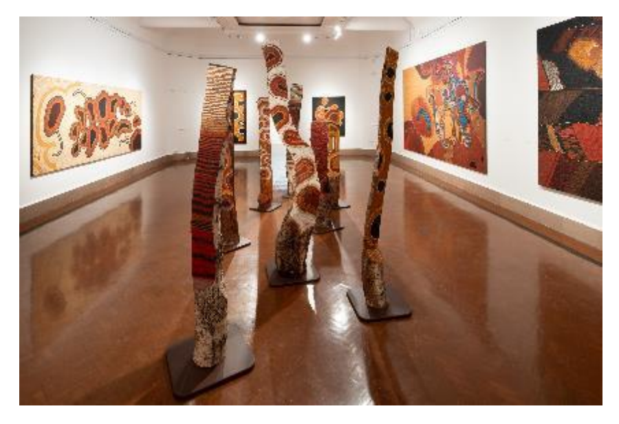
Installation image of John Hitchens, Aspects of Landscape. First online exhibition launched May 2020.

As a result of the lockdown in March 2020, the team quickly pivoted to develop our virtual and online presence. This included the gallery's social media output, producing content on a near daily basis on Instagram, Facebook, Twitter and YouTube channels as well as several online exhibitions on the website, for the first time in its history. There was an attempt to cater to a range of audiences with content relating to our collection, exhibitions and educational activities, including families and young people, those with an interest in art history, Southampton residents and artists. Content was produced in a range of formats, with a mixture of image-led posts, videos and in-depth, long form content. Feedback to posts encouraging more interactive engagement has been positive, including polls inviting followers to choose collection works to be reproduced on digital screens in the city and a digital reconstruction of the gallery's Baring Room.