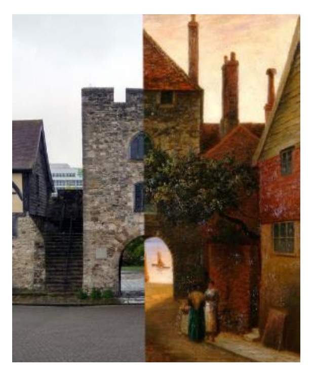
Frank Rawlings Offer, The West Gate, Southampton, 1898, Oil on Canvas SOTAG: 435 'half and half' image as part of social media local places post, April 2020

Instagram analytics reveal that around 45% of the account's followers are based in Southampton or Hampshire. Regular comments and shares of the Gallery's posts from Twitter and Facebook from members of the local community appear to echo their prominence amongst our digital audiences. Several series of posts across our channels aimed to tap into areas of the Gallery's activity with special relevance to the city. An example, is a collection of short video clips showing transitions between paintings of the local area in the collection and contemporary photographs of the same sites. The first, of the West Gate in the Old Town posted on 7 May performed very well on Instagram receiving 499 views, 149 likes, 5 shares, 5 saves, 4 comments. On Facebook, the same post reached over 1000 accounts and received 56 likes.